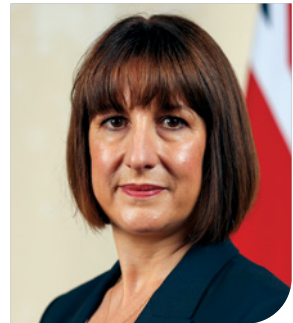
Official portrait of Rachel Reeves MP, by Lauren Hurley, licensed under Open Government Licence v3.0

The OBR, blushing from its pre-emptive publication of documents on the day, at least managed to summarise matters neatly: "...the Budget delivers a frontloaded increase in spending of £9 billion and backloaded increase in taxes of £26 billion".