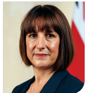
Official portrait of Rachel Reeves MP

From a longer term, strategic viewpoint, avoiding an annual cycle of Budget and quasi-Budgets makes sense, especially when, as now, the gap between events is only a few months. Many countries manage with only one yearly budget, resorting only to supplementary budgets when serious problems arise. Ironically, in the UK that might need to happen soon, depending upon developments in the Middle East.